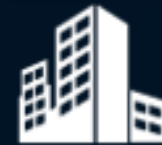
PC smart real estate